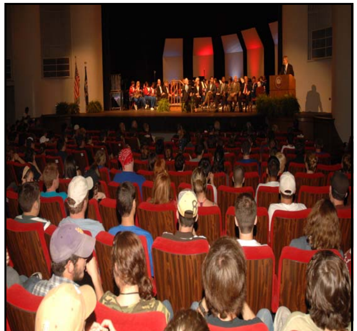
As part of the First-Year Experience, students participate in a convocation to begin their college experience.

The BARC's main focus is math tutoring, writing assistance, advising to undeclared majors, and University Seminar for undeclared majors. Tutoring in other subjects is offered with subjects and times offered updated regularly on their website, www.latech.edu/barc