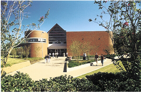
Institute for Micromanufacturing Louisiana Tech University Ruston, LA

A quest for the latest in research and technology materialized in 47 new grants and funding totaling $1,572,258. From the on-going re-