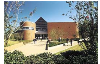
Institute for Micromanufacturing Louisiana Tech University Ruston, LA

BioMEMS efforts aimed at the development of select commercially viable micro and nanosystems for biomedical and biological applications; EnviroMEMS efforts aimed at the development of select commercially viable micro and nanosystems for environmental and chemical applications; Nanotechnology efforts directed at the development of select commercially viable nanotechnologies for BioMEMS, EnviroMEMS, and other applications; Information technology efforts are directly supportive of the State of Louisiana IT Initiative and current efforts include projects for the realization of enabling micro/nanotechnologies for information sensing, storage and processing.