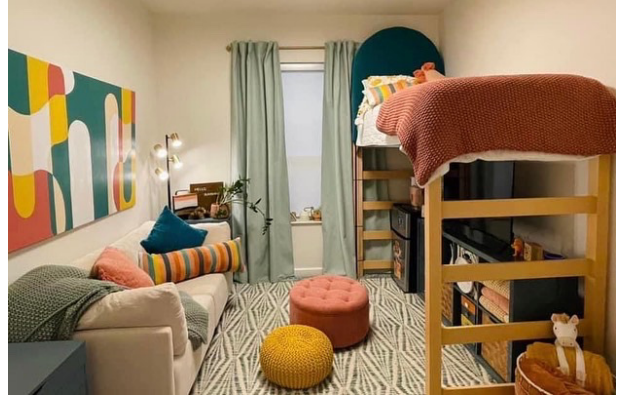
Flex bedroom with community bath (only bed and chest of 3 drawers included in room)

Separate smaller lounges/study rooms are located on each wing. The hall has three different room configurations – a suite style option where two students share a bathroom in their room, a private single bedroom option where 6-7 residents share a community restroom of two showers and two toilets, and a private flex bedroom option, that is a little larger than the private single bedrooms, where campers share a community restroom of two showers and two toilets with 7-14 residents. The suites have a shower in the bathroom to share with their roommate. The proximity to the new intramural fields as well as outdoor seating areas will provide opportunities for campers to gather outdoors. The first floor, south wing of Richardson will be utilized as retail/dining space by our Food Services and provide a convenient option to grab a snack for campers!