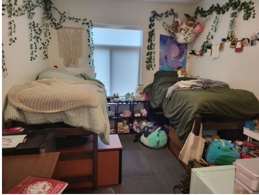
Suite room view (includes bathroom) Private