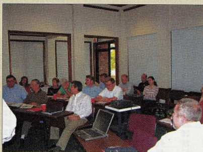
TTC IAB members discussing research topics.

The TTC held its annual Industry Advisory Board meeting in Ruston on Oct. 13-14, 2005. The board had a chance to hear firsthand from the students and faculty conducting a wide range of trenchless related research and also to provide their input on the most productive research directions to benefit the users and providers of trenchless technology. Special features of the meeting were the demonstrations of the donated Innerseal robot (see main article) and a special discussion on the impact of hurricanes Katrina and Rita on buried infrastructure along the Gulf Coast. TTC has received an award from the National Science Foundation under the Small Grants for Exploratory Research (SGER) program to do some early data collection on the effects of the storm surge, high winds and cleanup activities on buried infrastructure. This will be featured in a future newsletter.